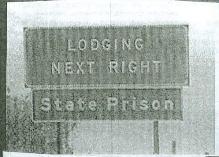
Gay Teen Sentenced to 17 Years in Prison

* Referring to LGBT youth, staff routinely used words like "fag," "butchie," "fruitcake," "fucking little bitches," and "fucking cunts."