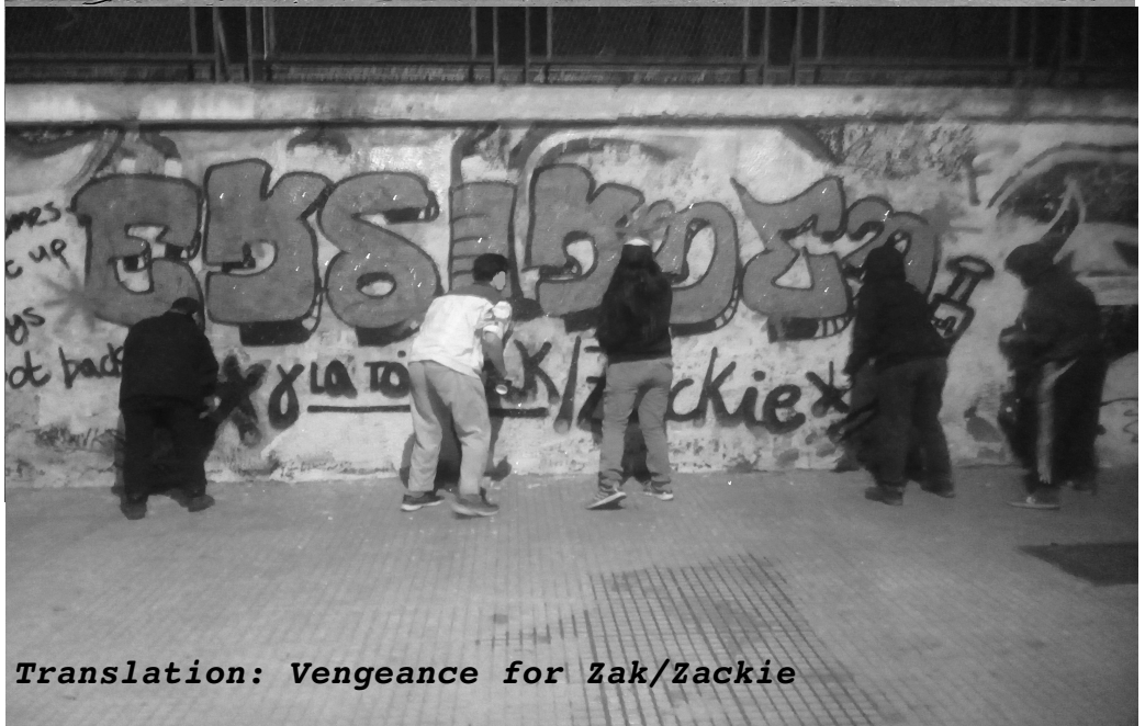
Translation: Vengeance for Zak/Zackie