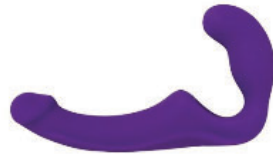
Fun Factory Share