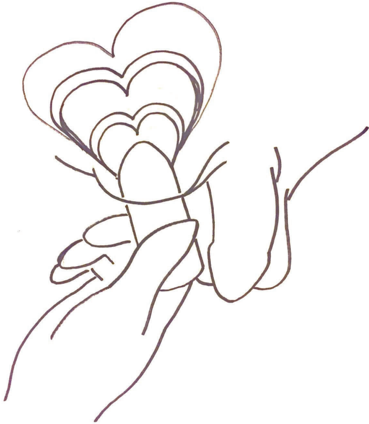
(front-facing view of someone muffing with vibrator)

the first step, but become the means by which we explore the sensitivities of another person's body with our mouth. Naturally kisses often develop into other forms of intimacy, but to think of them as their own opportunity for exploration is hugely helpful. Moreover, what is typically known as 'foreplay' becomes destabilised, because there is no proper –play that the 'fore' –play necessarily leads you towards. There is no way to fail at sex, because every sexual moment, even something as light as cuddling, serves the important function of bonding people together.