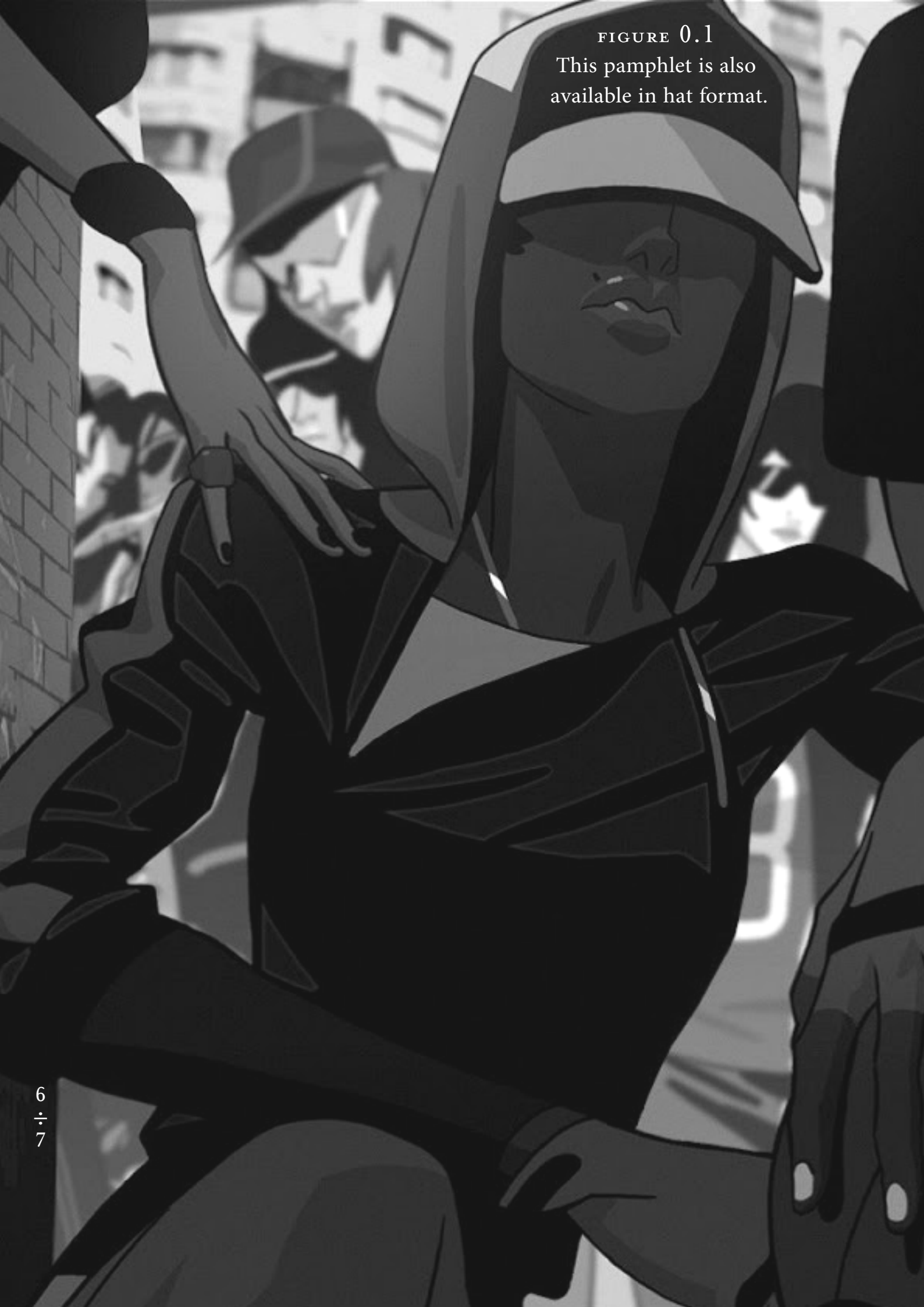
FIGURE 0.1 This pamphlet is also available in hat format.